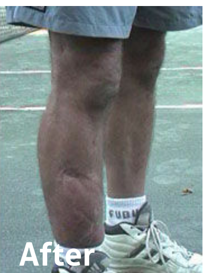
potential of Miracles of Non-Medicine.

Sports Remedies – A Myriad of Sports injuries have been identified and influenced by BioAcoustic protocols from concussions to foot injuries to accelerated bone and muscle recuperation. One of the most important aspects of BioAcoustic Biology evaluation is the ability to predict what muscles are in stress before symptoms or injury occurs, allowing coaches to keep their players off the bench.